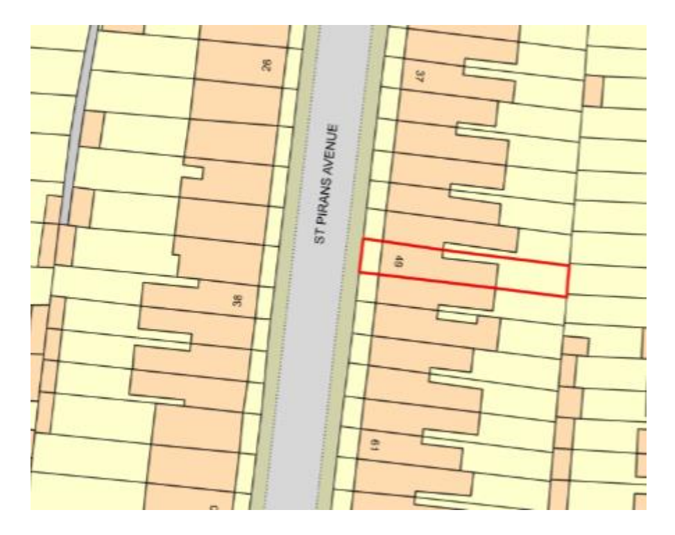
Figure 1 - Site Location Plan