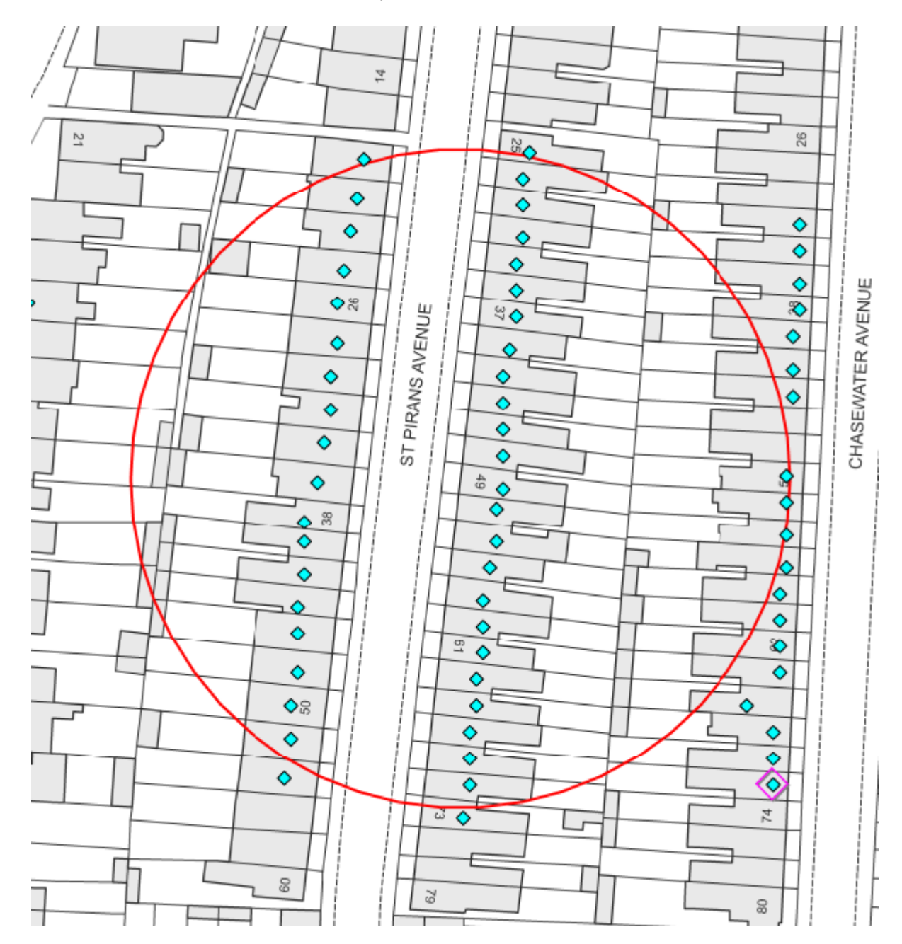
Figure 4 - Existing HMOs within 50m of the application site

8.6 Following further Officer Investigation, no additional HMOs have been uncovered by the Case Officer. Including the application property and the HMO at No. 72 Chasewater Avenue, the proposal would bring the percentage of HMOs within the area up to 2.82% This would be lower than the 10% threshold above which an area is considered to be imbalanced and in conflict with Policy PCS20.